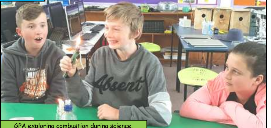
GPA exploring combustion during science. Wicks and fuels like baby oil, margarine, cooking oil, lavender oil and almond oil to create facilitate burning. Why combustion sometimes stops!