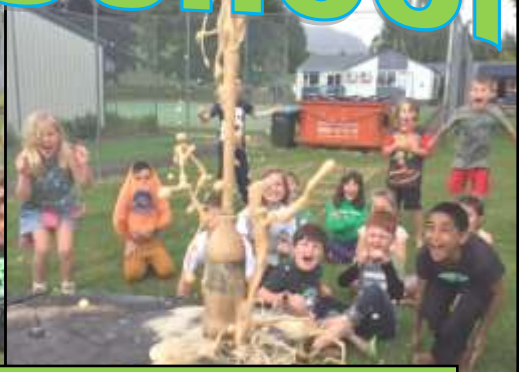
Pod 2 have been enjoying learning about chemical reactions with Mentos and fizzy drink this week. FUN!